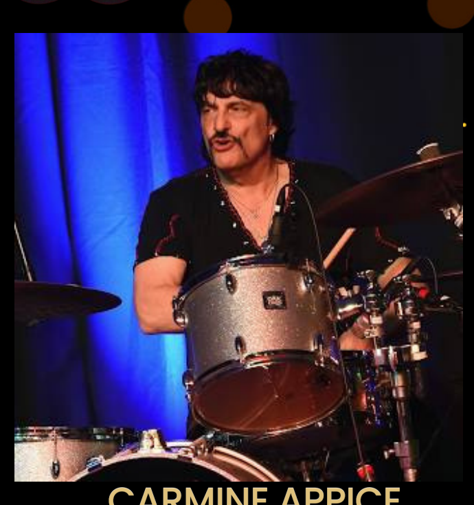
CARMINE APPICE DRUMS